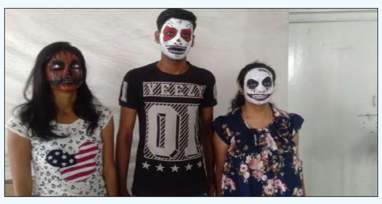
Face painting Competition