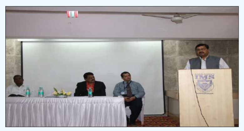
NAAC Peer Team member addressing the Staff of IMS.