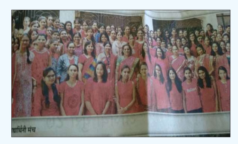
Red color Day Celebration by IMS Vidyarthini Manch

IMS Vidyarthini Manch had celebrated Red Color Day for IMS students and teaching and non teaching staff on 16th October 2018.