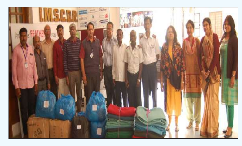
Donation by IMS to Snehabandh, Salvation Army and Green

enrichment) and Green Sole (NGO that recycles discarded shoes / chappals to comfortable footwear)